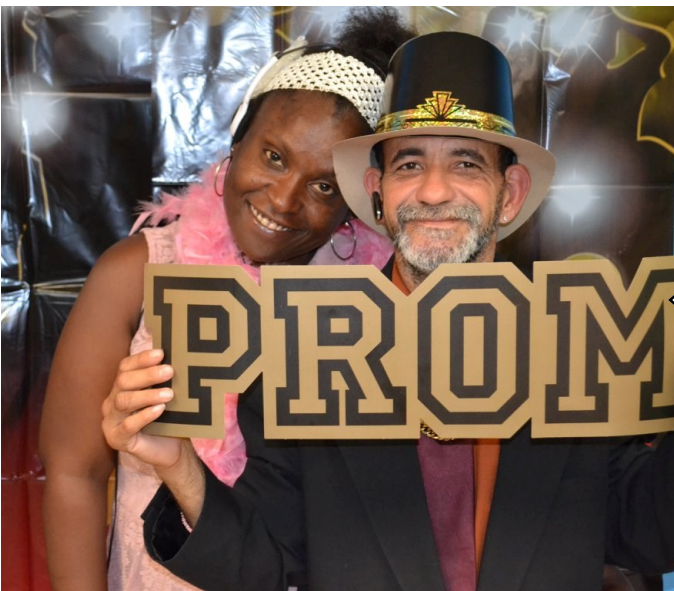
Events like this year's "Hollywood" themed Prom remind our members and staff that enjoying some fun time with others is also a vital part of working towards rehabilitation.

Fellowship House strives to provide high quality services with positive outcomes for our members. Psychiatric Recidivism was 1.4% and Consumer Satisfaction with Services was 91%.